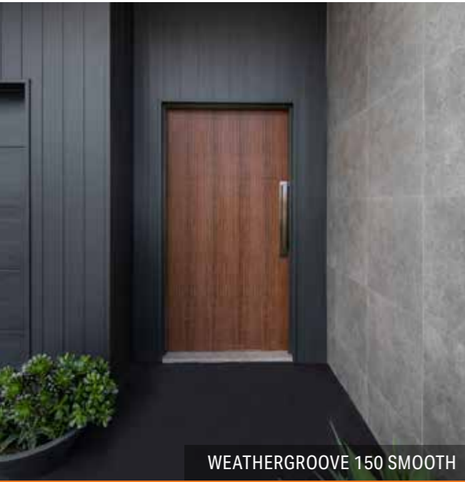
WEATHERGROOVE 150 SMOOTH

Weathergroove is the ideal choice for the urban contemporary home. It's the largest panel available in the Australian market, making this vertically grooved panel ideal for covering large areas in a short amount of time and it's versatility offers endless possibilities.