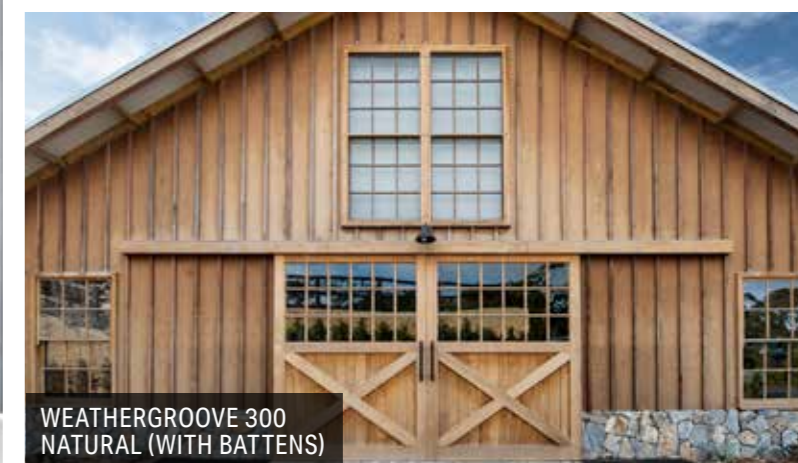
WEATHERGROOVE 300 NATURAL (WITH BATTENS)

BONUS ENTRY WHEN YOU SIGN UP TO MITRE 10 TRADE + PASS