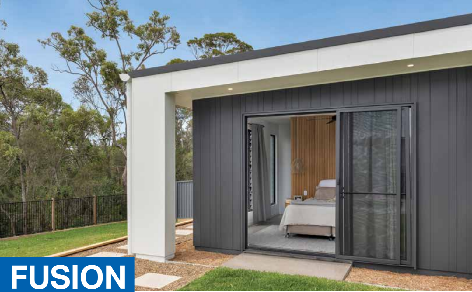
WEATHERGROOVE 75 SMOOTH