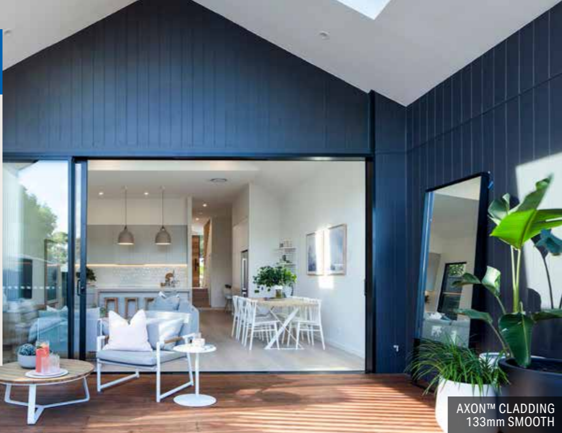
AXON™ CLADDING 133mm SMOOTH

The pre-primed grooved panels are easy to install, creating an impact when utilised for external walls, upper-storey and ground-level extensions, and internal feature walls.