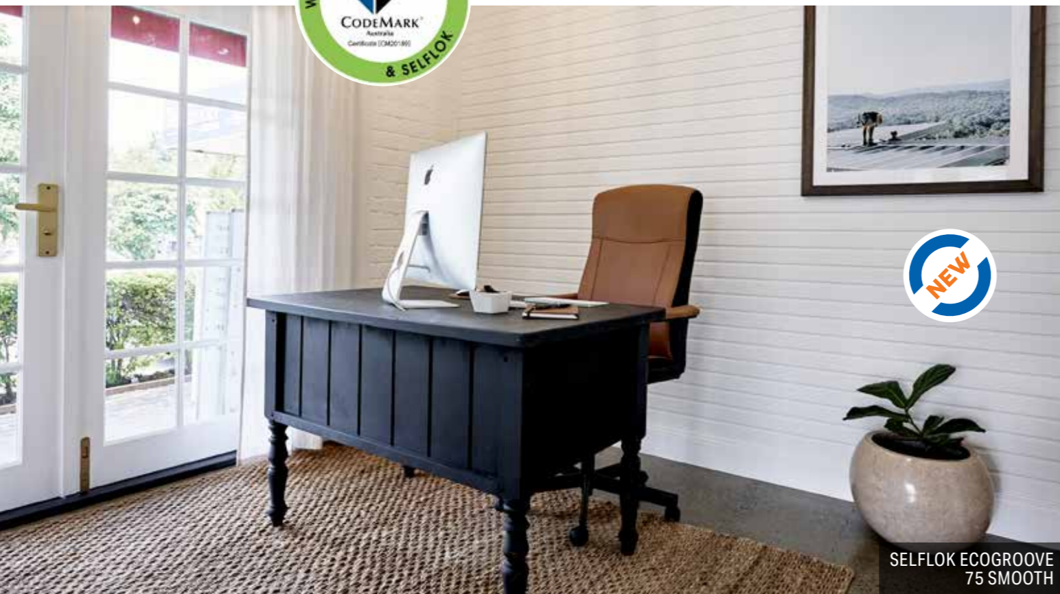
SELFLOK ECOGROOVE 75 SMOOTH

PrimeLok is Weathertex's most popular range for achieving traditional sophistication and elegance. Regardless if you select Hamptons styling for urban living or a more relaxed coastal style, PrimeLok has a wide range of profiles to create this look.