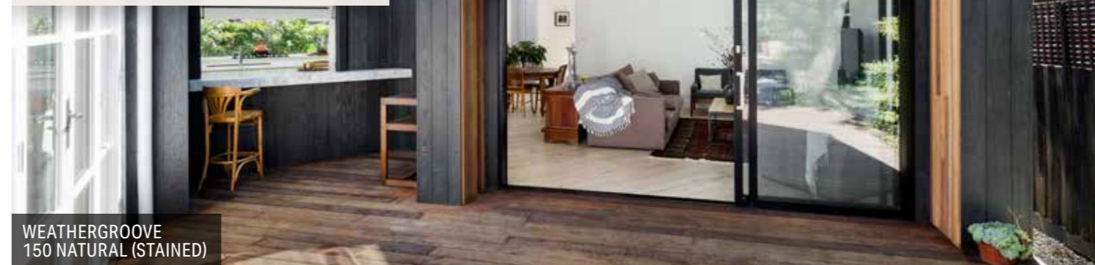
WEATHERGROOVE 150 NATURAL (STAINED)

Natural range can be left unsealed to silver-off, stained or a combination of both to create the perfect 'look'.