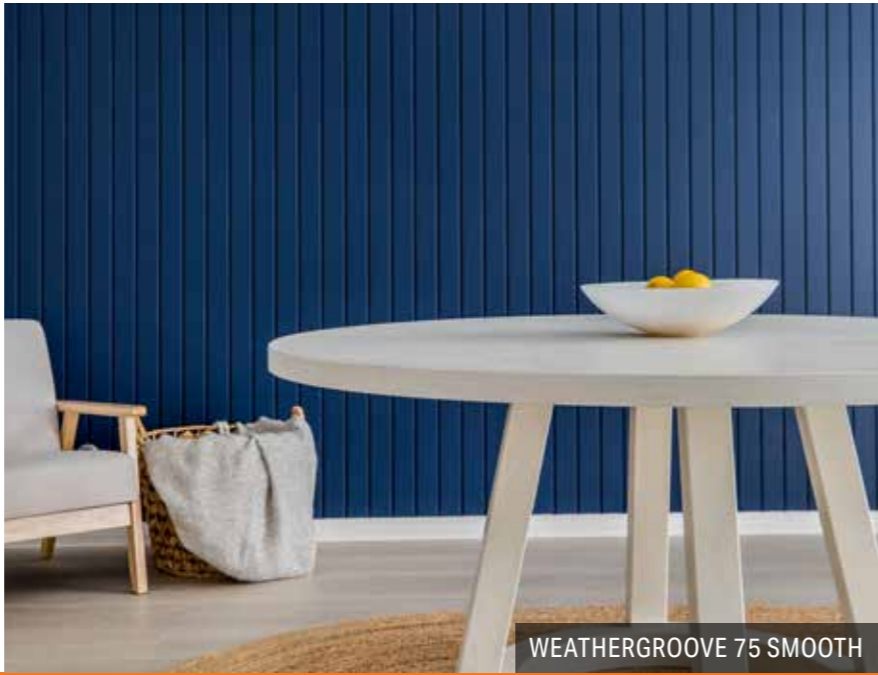
WEATHERGROOVE 75 SMOOTH