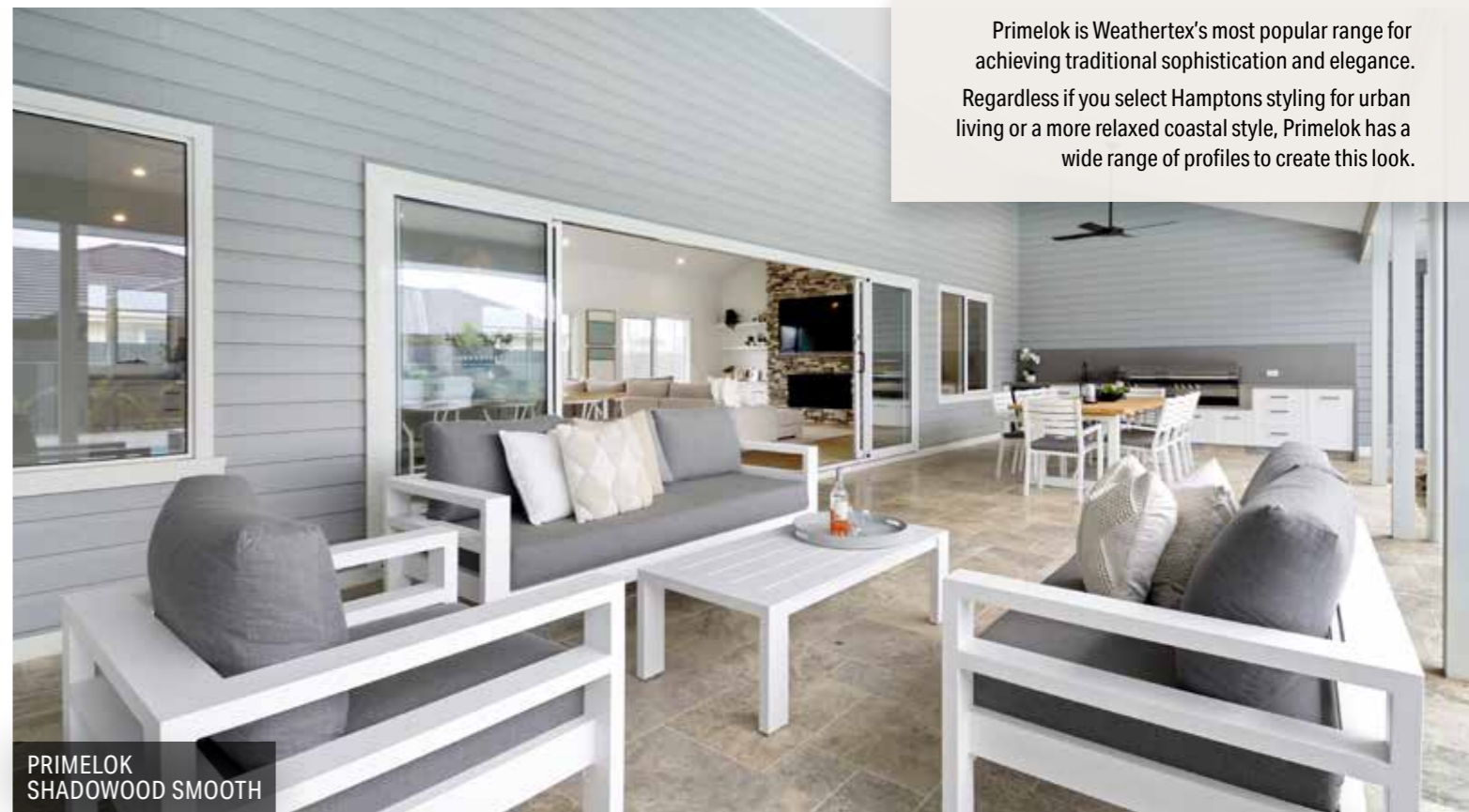
PRIMELOK SHADOWWOOD SMOOTH