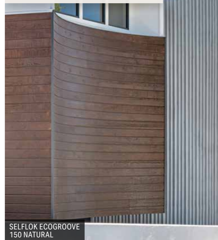
SELFLOK ECOGROOVE 150 NATURAL

Curved walls can be achieved down to a minimum of 2.5m radius for Selflok and 7m for Weathergroove.