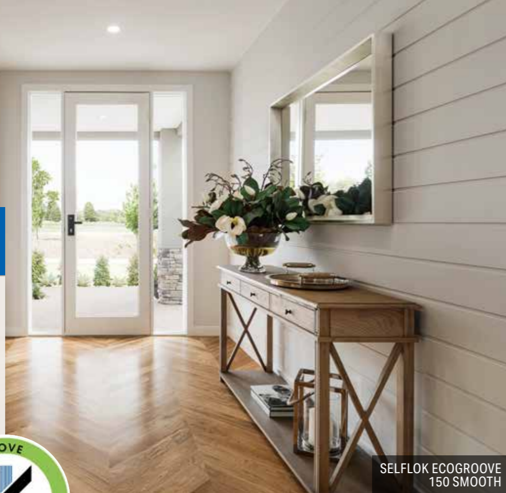
SELFLOK ECOGROOVE 150 SMOOTH