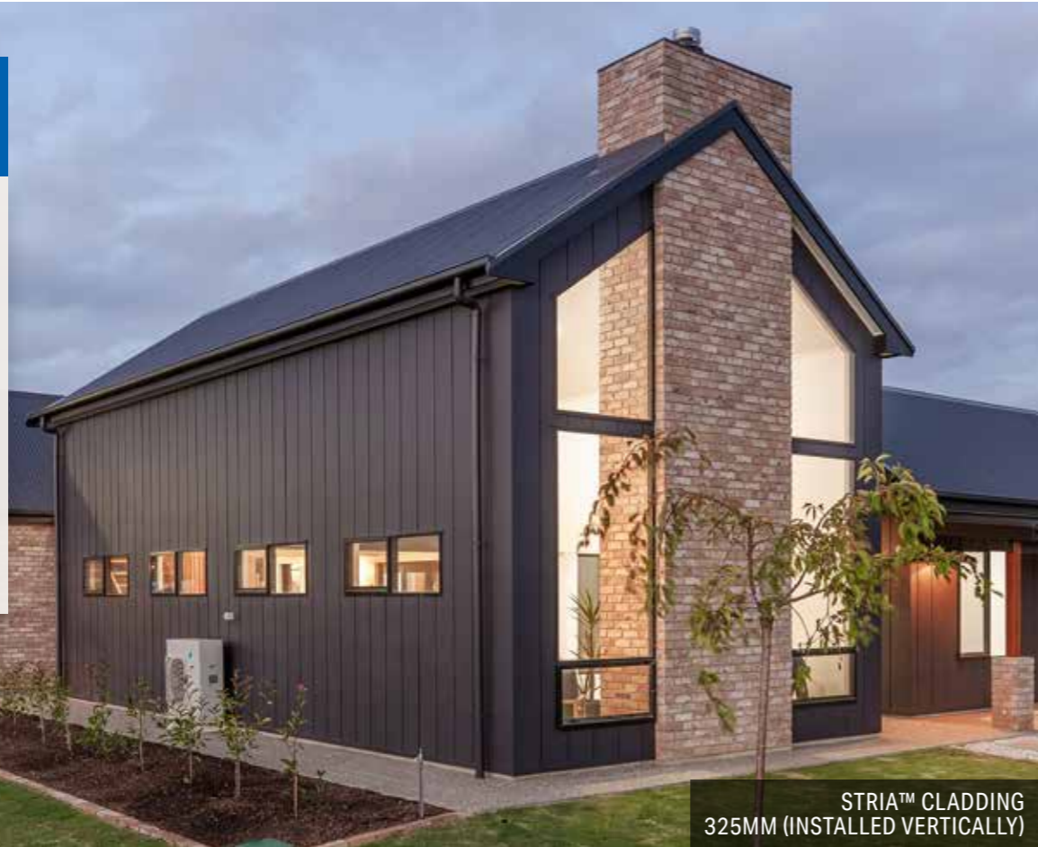
STRIA™ CLADDING 325MM (INSTALLED VERTICALLY)

Stria™ 325mm and 405mm profiles are 14mm thick fibre cement with shiplap joints that leave a 15mm wide horizontal groove for strong clean lines.